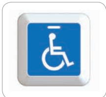
Sticker Option 2