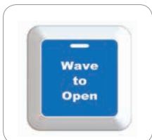
Sticker Option 3