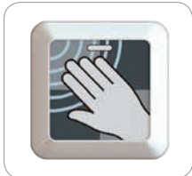
Sticker Option 1